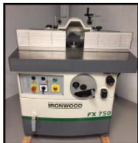
Ironwood FX750 shaper with aluminum finger fence and interchangeable spindle