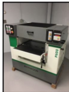
Ironwood P600 24" planer with helical cutter head