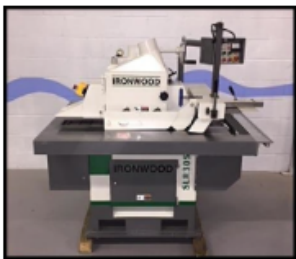
Ironwood SLR305 Straight Line Rip saw with Laser light