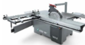
Altendorf WA-8TE 10' sliding panel saw. Electric blade controls Learn more