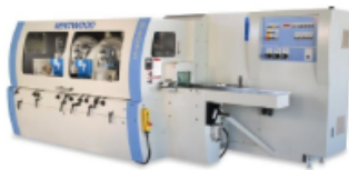
Kentwood 609-s 6 head moulder with PRO- LOCK spindles, variable speed spindles